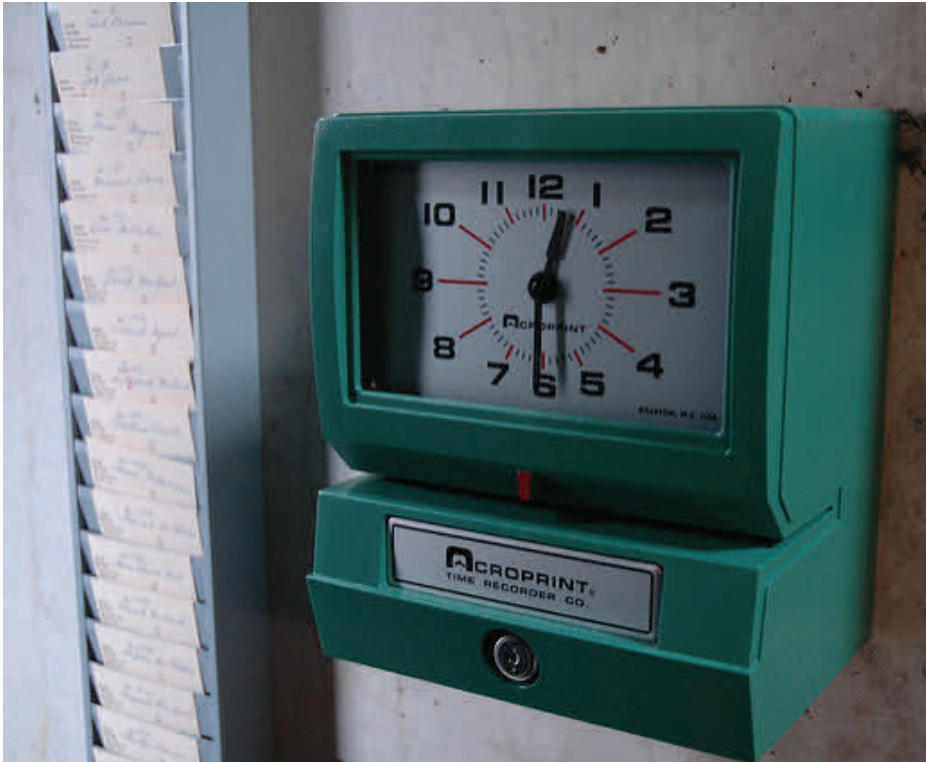
Time cards and punch clock.